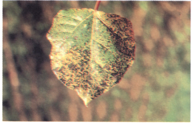
Figure 4. Symptoms of leaf blister on an oak leaf.

irregular dark brown or blackish spots. Defoliation may result.