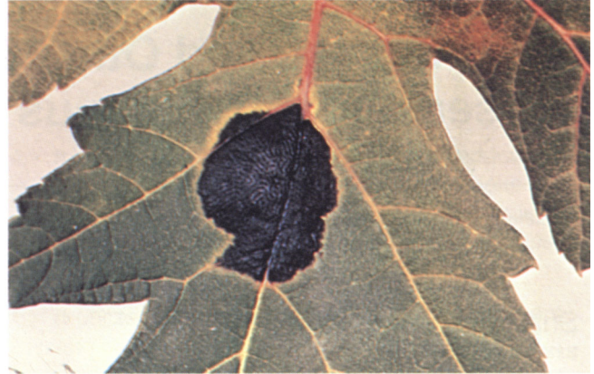
Figure 2. Symptoms of Septoria leaf spot on a poplar leaf.